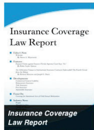
Insurance Coverage Law Report