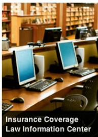
Insurance Coverage Law Information Center