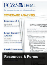
Resources & Forms